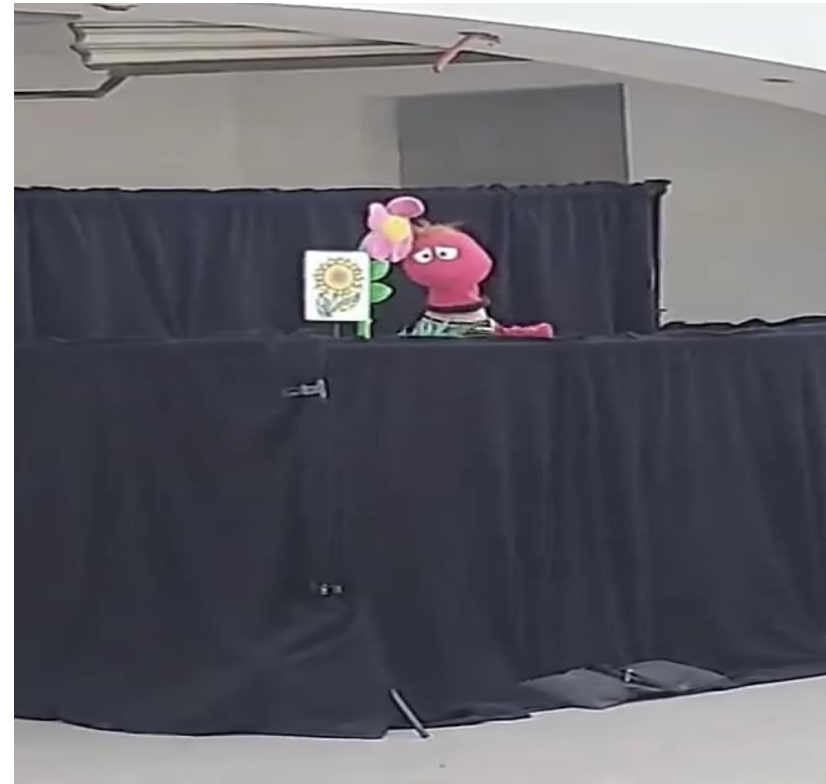
The Puppet Team

Both teams used their ministries to share the Good News of Jesus Christ!