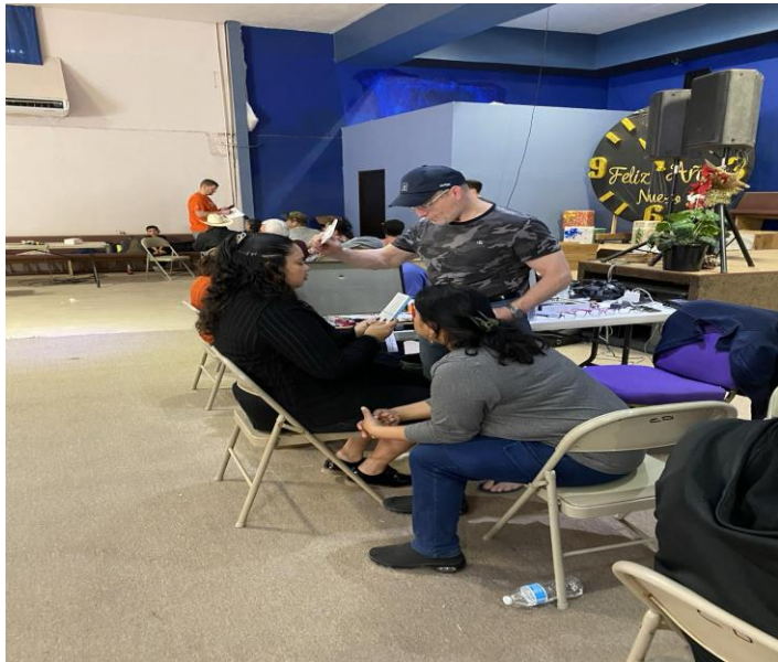
Seven: Doctor Assessment