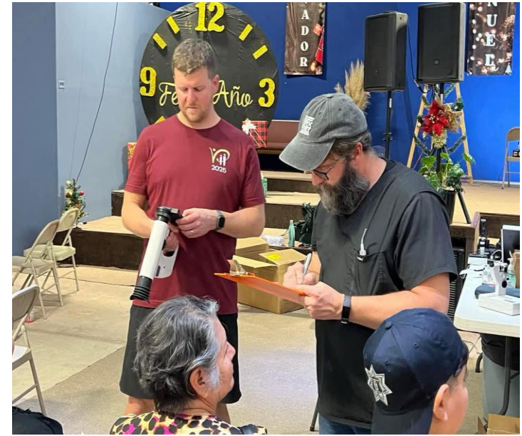
Six: Retinal Camera