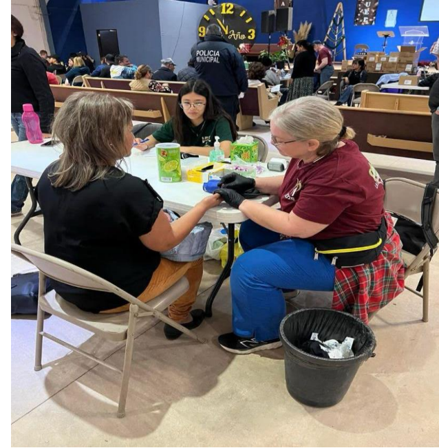
Three: Blood Sugar and Pressure