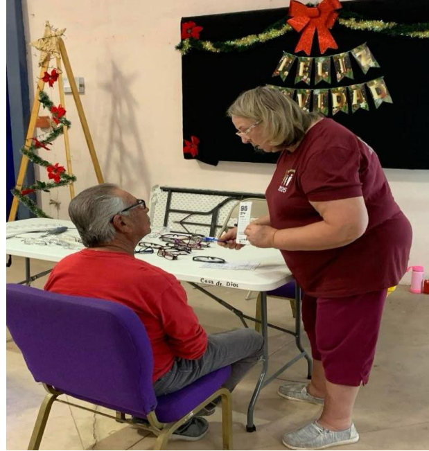
Two: Near and Far Visual Acutities