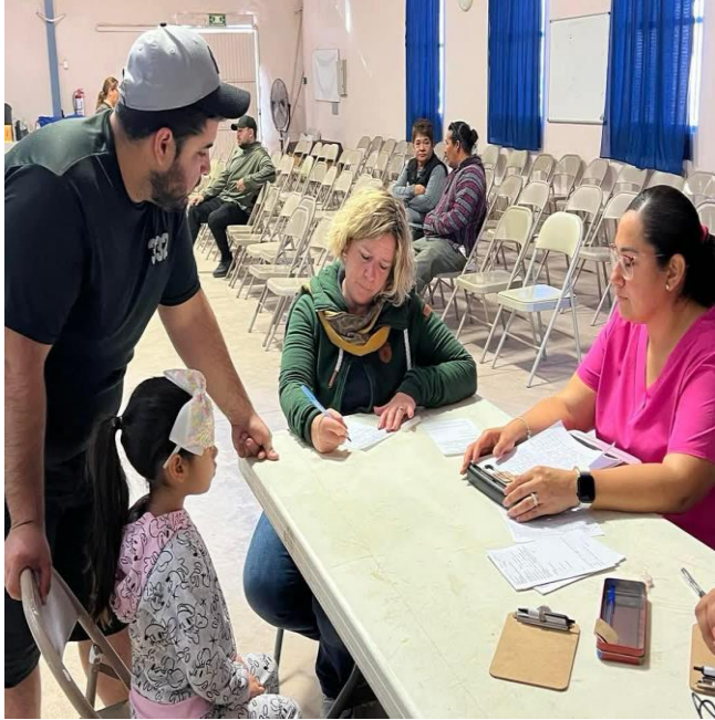
One: Case History