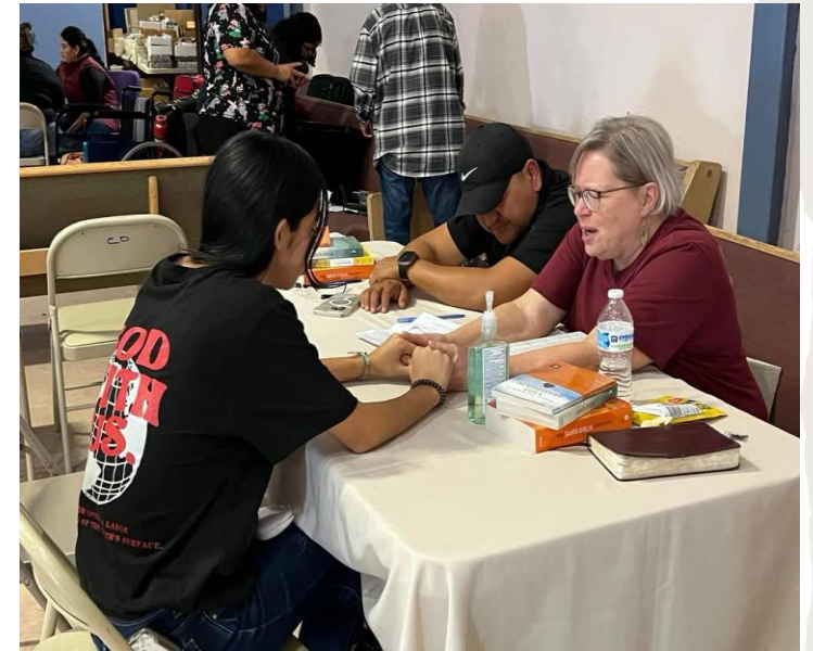
Nine: Prayer & Evangelism