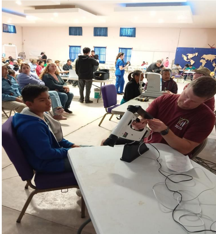
The Eye Clinic Team