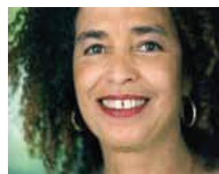
Angela Davis, Human Rights Activist, Author "Frameworks for Social Justice" February 10, 2010

Civil rights and diversity speaker Morris Dees is the co-founder of the Southern Poverty Law Center, a non-profit group specializing in lawsuits involving civil rights violations, domestic terrorism, and hate-motivated crimes. He focuses his attention on anti-government militias. In his brilliant expose Gathering Storm: America's Militia Threat, Dees explains the dangers these groups represent.