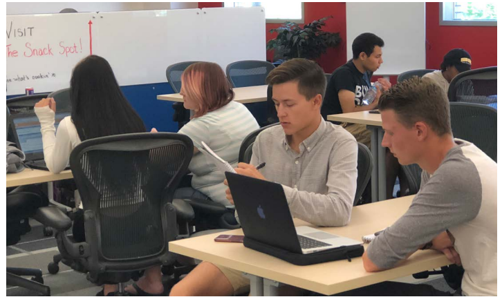
Students enjoying ability to collaborate and learn in new Academic Literacies Center.

The new Academic Literacies Center (ALC) opened its doors for the first time in August. The ALC embraces a holistic approach to student learning, including recognition of the visible and not-so-visible barriers to success. It provides students opportunities to be successful in particular courses, specific content areas, and/or finding ways past their barriers.