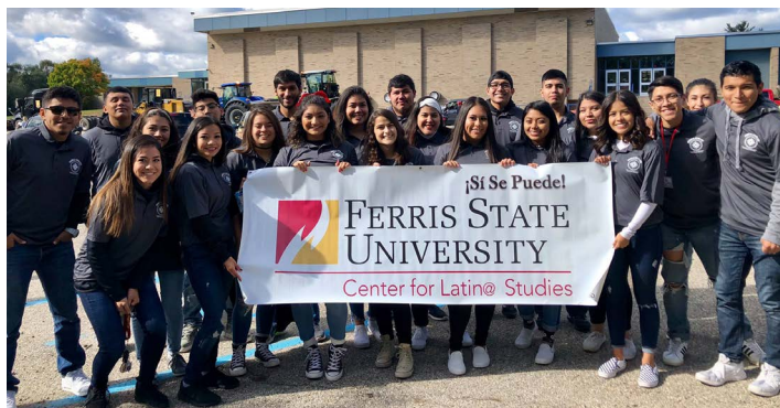
The Promesa Scholars at Ferris' Homecoming parade.

Academics are central to the program. PSP assists the students to develop and practice skills in self-advocacy, research development, and personal accountability. In addition, limited scholarships are awarded every year based on overall Promesa Scholar performance and standing.