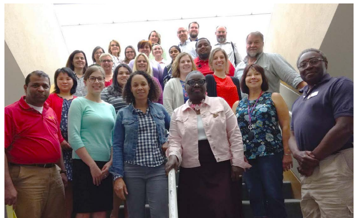
Faculty members at the Grant Proposal Writing workshop.