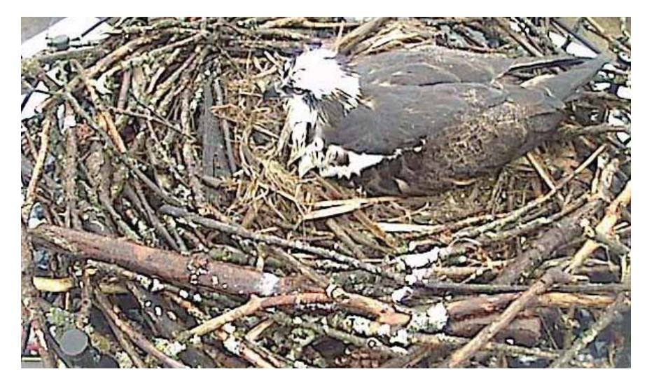
Check out Ferris' Osprey Cam at www.ferris.edu/osprey to see live coverage 24 hours a day of the birds in their habitat. The Osprey cam is perched high atop a light pole in the Swan Building parking lot and overlooks the birds' nest, built on a man-made platform designed specifically for the birds which make an annual pilgrimage to Big Rapids. The Osprey is a bird of prey that specializes in capturing and eating fish. Osprey build bulky nests of sticks on structures such as dead trees. In many areas they readily build their nests on man-made structures such as power poles, billboards and communication towers.