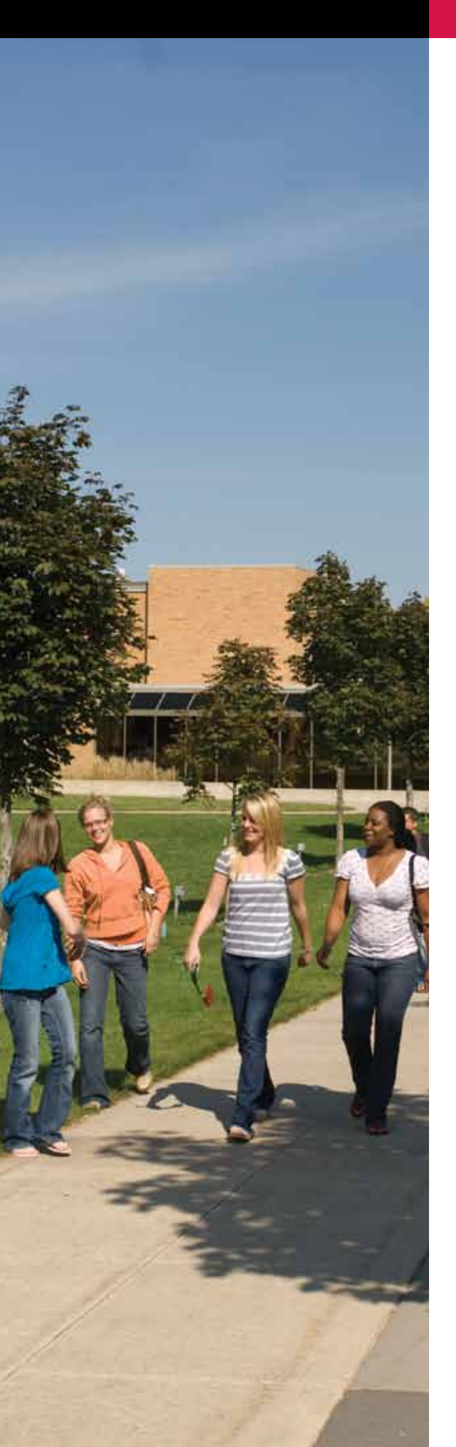
Students Give Back Through Community Service page 4