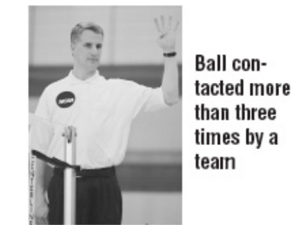
Indicate side at fault