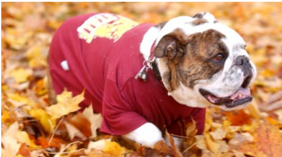
Bulldogs Taking Action—Looking Out for Our Friends and Fellow Students