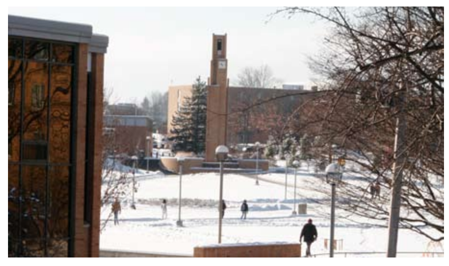
Snow turned the Campus Quad into a winter wonderland as students come and go from the Rankin Student Center on their way to class and the Ferris Library for Information, Technology and Education.