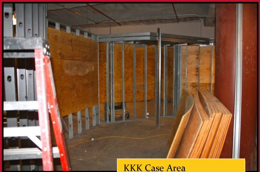
KKK Case Area

On the other side of the porter's face they will find a kitchen. During the Jim Crow period, a typical American kitchen had many products with images that portrayed blacks in negative ways; these included packaging for cereal, syrup, pancake mix, and detergent; salt