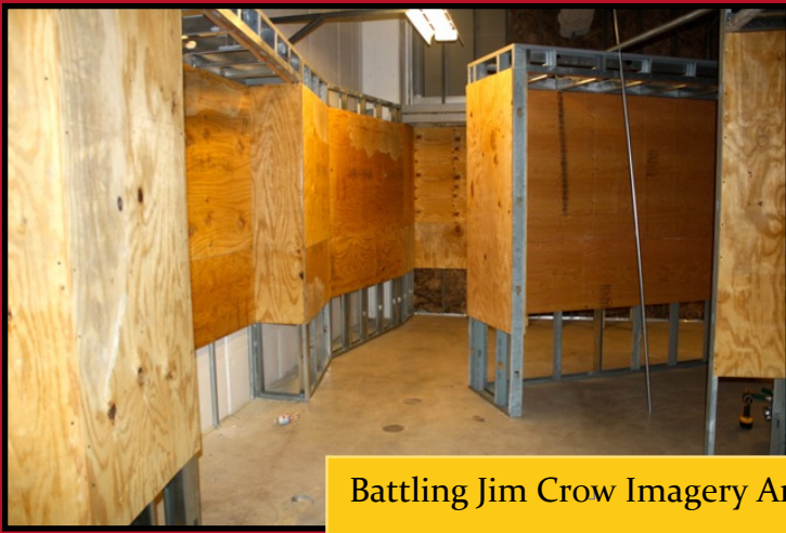
Battling Jim Crow Imagery Area