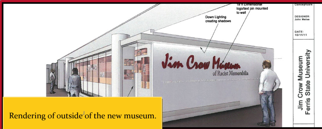
Rendering of outside of the new museum.