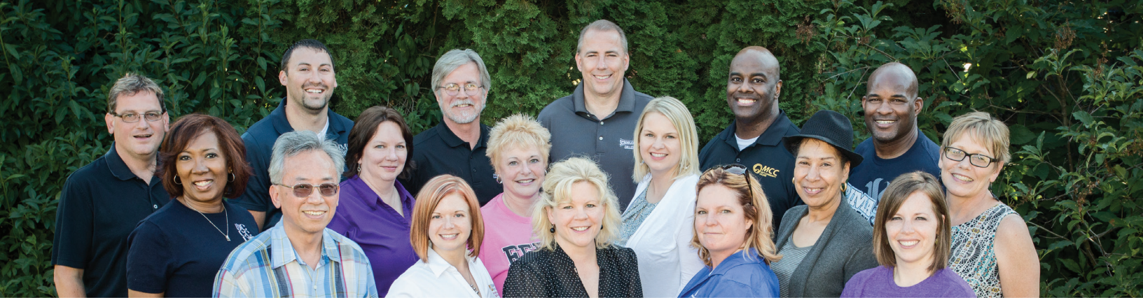
PICTURED: Cohort Four during their summer picnic kicking off year three.